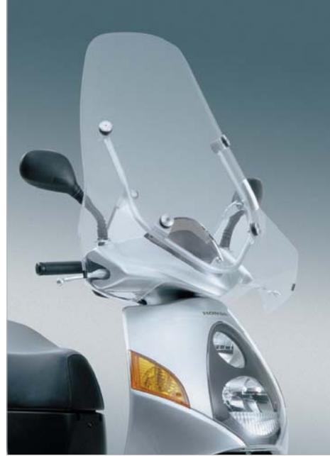
⑬ Windshield 500 x 506 x 4mm Polycarbonate Lexan windshield offering perfect protection against the elements, with integrated hand protectors. Specially designed to ensure utmost vehicle stability, limiting vibration. The rubber, mounted stay allows the shield to fall forward on impact and is WVTA (Whole Vehicle Type Approval) cleared.