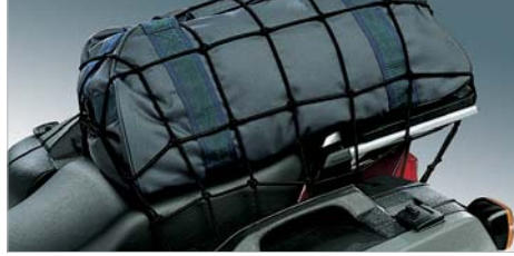
⑨ Cargo Net Useful net to secure luggage to rear carrier and/or pillion seat. Available in Black.