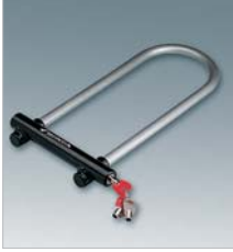
⑧ U-Lock 120/340 Designed to offer greater security. Complete with tamper-resistant barrel and key. Easily stored under seat.