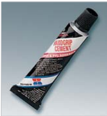
⑭ Honda Bond A A special, heat-resistant glue to be used when fitting heated grips.