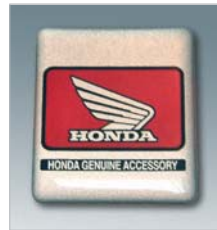
⑮ Emblem Honda Wing logo which can be used with a top box or pannier set.