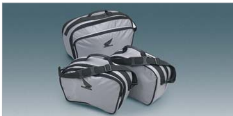
⑯ Top Box 45ltr Inner Bag Practical light grey nylon bag with expandable capacity from 21-33 litres. Handy front pocket with embroidered Honda Wing logo, (takes A4 file), adjustable shoulder belt and carrying handle.