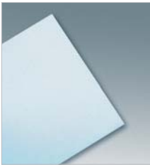
⑩ Protective Film This self-adhesive, clear film can be cut to fit any area of paintwork, to help prevent scratches.