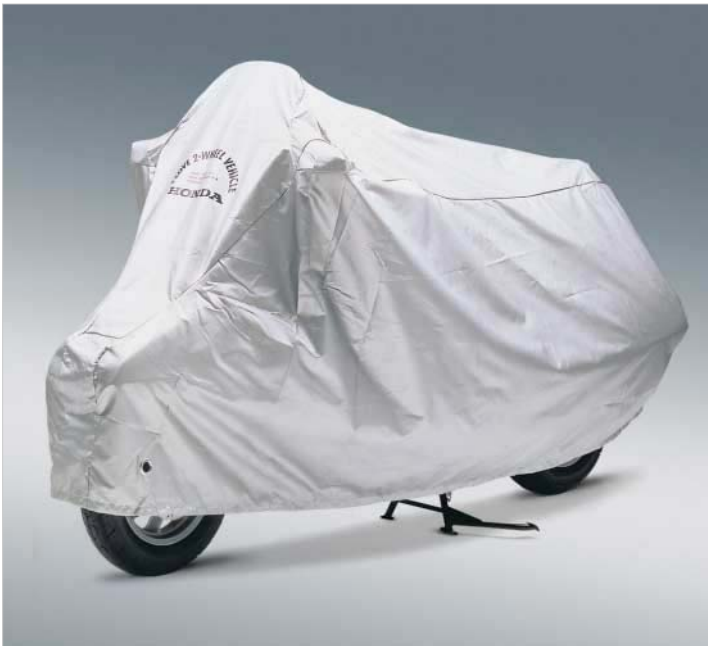
⑭ Body Cover Manufactured from water-resistant, breathable fabric that enables the motorcycle to dry. Offers good protection from UV rays. A rope is included to tighten the lower edges to avoid damage in bad weather. Also there are two holes in the front so that a lock may be used.