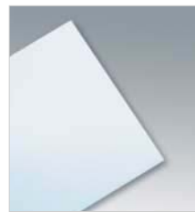
⑮ Protective Film This self-adhesive, clear film can be cut to fit any area of paintwork, to help prevent scratches.

These specification details do not apply to any particular product which is supplied or offered for sale. Manufacturers reserve the right to vary their specifications, including colours, with or without notice and at such times in such manner as they think fit. Major as well as minor changes may be involved. Every effort, however, is made to ensure the accuracy of the particulars contained in this brochure. This publication shall not constitute in any circumstances whatsoever an offer by the Company to any person. All sales are made by the Distributor or Dealer concerned subject to and with the benefit of the standard Conditions of Sale and Warranty given by the Distributor or Dealer, copies of which may be obtained from him on request. This publicity material applies to the UK only Trade Descriptions Act (1968). Whilst efforts are made to ensure specification accuracy, brochures are prepared and printed several months in advance of distribution and consequently cannot always immediately reflect either changes in specification or in some isolated cases the provision of a particular feature. Customers are always advised to discuss specification details with the supplying Dealer especially if your selection is dependent upon one of the features advertised. Subject to availability.