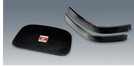
⑧ Top Box Colour Panel Set A colour panel set to tailor the non-colour matched 45 litre top box. Available primer coated and in body colours. Features Honda Wing logo emblem.