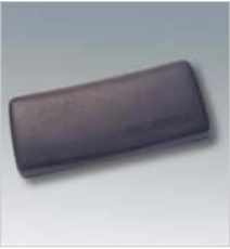
⑨ Top Box Pad A backrest pad on the top box gives greater pillion comfort. For use with 45ltr top box - non colour matched only.