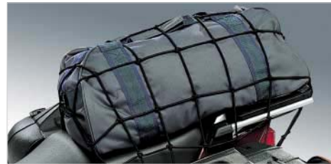
⑬ Cargo Net Useful net to secure luggage to rear carrier and/or pillion seat. Available in Black.