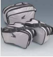
⑥ Top Box 45ltr Inner Bag Practical light grey nylon bag with expandable capacity from 21-33 litres. Handy front pocket with embroidered Honda Wing logo, (takes A4 file), adjustable shoulder belt and carrying handle.