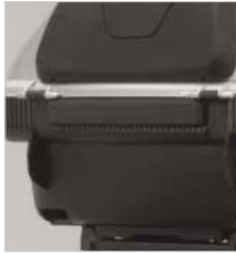
⑩ Additional Top Box Pad Additional pillion backrest pad for application to the lower top box, enhancing superior comfort.