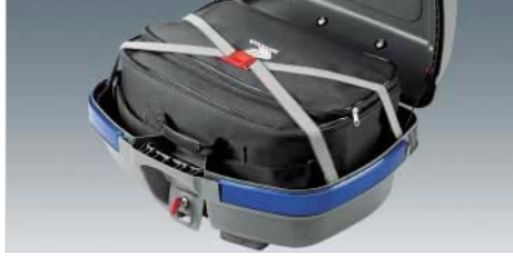
⑦ Top Box 45ltr Inner Bag Practical black nylon bag with expandable capacity from 21-33 litres. Handy front pocket with silver Honda Wing logo, (takes A4 file), adjustable shoulder belt and carrying handle.