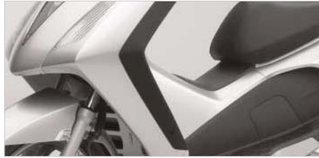
⑪ Leg deflector set Side-mounted shields to extend the leg shield range of wind protection by deflecting the cold away from the riders feet and legs. Black polyurethane.