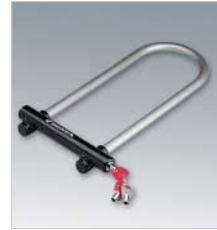
⑫ U-Lock 120/340 Designed to offer greater security. Complete with tamper-resistant barrel and key. Easily stored under seat.