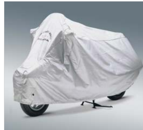
⑲ Body Cover

The perfect place to store all essential tools for quick motorcycling maintenance. Capacity approx. 1.7 litres.