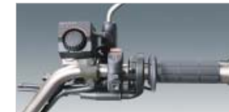
⑳ Grip Heater Kit

Manufactured from water-resistant, breathable fabric that enables the motorcycle to dry. Offers good protection from UV rays. A rope is included to tighten the lower edges to avoid damage in bad weather. Also there are two holes in the front so that a lock may be used.