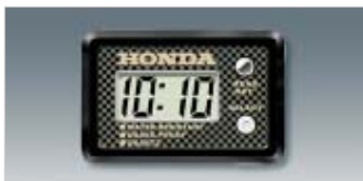
⑭ Mini Clock

Flexible, adjustable grip heater to warm fingers on cold winter mornings. The grip heater incorporates a plate that heats the underside of the grip. Integrated circuit to protect the battery from drain. For connection you should purchase items 27 and 28.