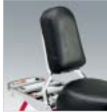
9 Backrest 10 Rear Carrier/Backrest Stay A leather-look backrest for that added pillion comfort and style. Must be combined with rear carrier stay.