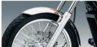
21 Front Mudguard Chrome-plated front mudguard.