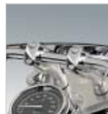
⑯ Handlebar Clamp

Chromed finished cap to add extra detail.