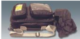
19 Magnetic Tank Bag 13 ltr Useful magnetic tank bag providing 13 litre capacity. Stores an A4 size file, plus personal belongings. Complete with rain cover.