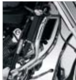
17 Chrome Radiator Cap 18 Chrome Radiator Guard A chrome radiator cap and chrome radiator guard. Both polished and buffed for a long-lasting, brilliant finish. The radiator guard adds to that authentic look and offers radiator protection.