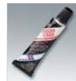
㉑ Honda Bond A

Billet finish, front brake calliper cap for added style.