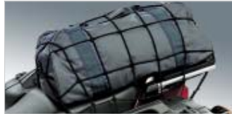
14 Cargo Net Useful net to secure luggage to rear carrier and/or pillion seat. Available in Black.