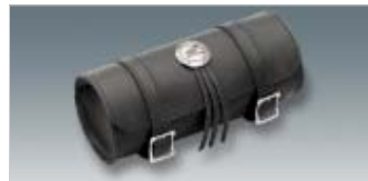
⑬ Leather Toolbag

A split leather 1.7 litre backrest bag decorated with Honda concho.