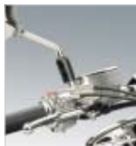
⑮ Front Brake Master Cylinder Cap

Useful carbon dial clock only 3.5 x 2.3 x 1cm in size, guaranteed to be fully waterproof.