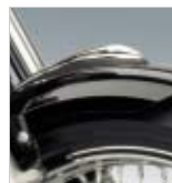
㉑ Front Mudguard Ornament

A chromed headlight peak giving an enhanced look and offering improved lighting in bad weather.