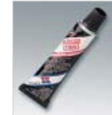
30 Honda Bond A A special, heat-resistant glue to be used when fitting heated grips.

Flexible, adjustable grip heater to warm fingers on cold winter mornings. The grip heater incorporates a plate that heats the underside of the grip. Integrated circuit to protect the battery from drain. For connection you should purchase items 26, 27 and 28.