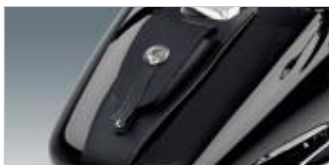
⑱ Leather Tank Belt

Useful net to secure luggage to rear carrier and/or pillion seat. Available in Black.