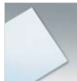
㉒ Protective Film

A 100gr tin of waterproofing grease to keep your leather moisturised and water-proofed. Do not use on suede leather.