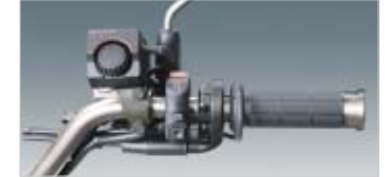
25 Grip Heater Kit 26 Sub Harness + 27 Sub Harness -

Flexible, adjustable grip heater to warm fingers on cold winter mornings. The grip heater incorporates a plate that heats the underside of the grip. Integrated circuit to protect the battery from drain. For connection you should purchase items 26, 27 and 28.