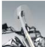
22 Windshield A tall, wide shield that offers extra protection from the elements. Comes complete with chrome stays.