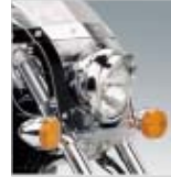
12 Headlight Visor A chromed headlight peak giving an enhanced look and offering improved lighting in bad weather.