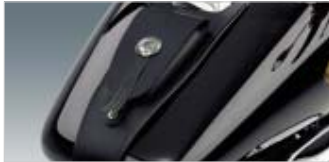
13 Leather Tank Belt Split leather belt with pocket. Decorated with Honda concho.