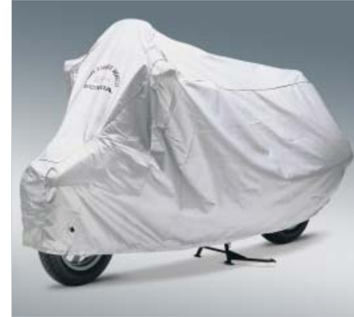
29 Body Cover Manufactured from water-resistant, breathable fabric that enables the motorcycle to dry. Offers good protection from UV rays. A rope is included to tighten the lower edges to avoid damage in bad weather. Also there are two holes in the front so that a lock may be used.