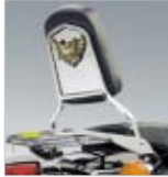
7 Backrest Plate Plain 8 Backrest Plate With Phoenix Logo A steel chrome-plated backrest plate to mount the backrest. Comes with or without logo.