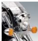
⑲ Headlight Visor

Split leather belt with pocket. Decorated with Honda concho.