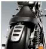
⑩ Rear Carrier (not shown)

A steel chrome-plated backrest and pad. Needs to be combined with backrest stay that includes a rear carrier.