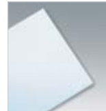
24 Protective Film This self-adhesive, clear film can be cut to fit any area of paintwork, to help prevent scratches.