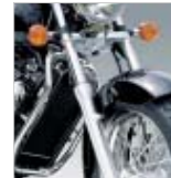
20 Front Fork Covers Chrome-plated fork covers.