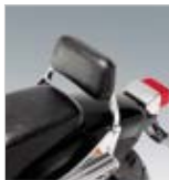
⑦ Backrest (high type) (see 12)