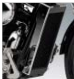
㉒ Radiator Cover

A special, heat-resistant glue to be used when fitting heated grips.