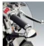
⑰ Chrome Lever Kit

Stylish chrome handlebar clamps, buffed and polished for a smoother, longer-lasting finish.