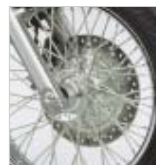
㉑ Front Brake Calliper Cap

Polished aluminium feature that adds authentic character.