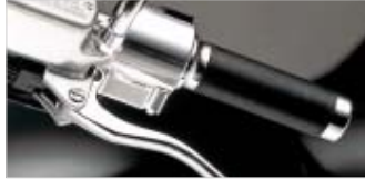
11 Custom Handlebar Grips A set of black rubber custom handlebar grips for greater control.