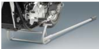
㉒ Maintenance Stand

Chromed radiator cover enhances the custom look.