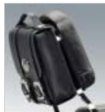
⑫ Backrest Bag

A chrome-plated rear carrier. This comfortable single seat comes with a stylish chrome and leather rear mudguard protector.