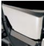
16 Side Covers Chrome side covers add a striking change to the look of the VT125C.