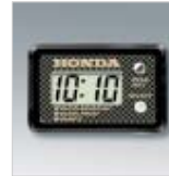
15 Mini Clock Useful carbon dial clock only 3.5 x 2.3 x 1cm in size, guaranteed to be fully waterproof.