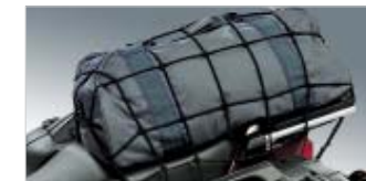
⑳ Cargo Net

Deluxe chrome lever kit for the front brake and clutch.