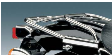
⑩ Rear Carrier A round tube chrome-plated steel plate featuring decorative cut-outs. Does not require a carrier stay.