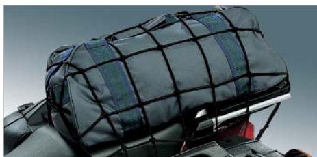
⑳ Cargo Net Useful net to secure luggage to rear carrier and/or pillion seat. Available in Black.

These specification details do not apply to any particular product which is supplied or offered for sale. Manufacturers reserve the right to vary their specifications, including colours, with or without notice and at such times in such manner as they think fit. Major as well as minor changes may be involved. Every effort, however, is made to ensure the accuracy of the particulars contained in this brochure. This publication shall not constitute in any circumstances whatsoever an offer by the Company to any person. All sales are made by the Distributor or Dealer concerned subject to and with the benefit of the standard Conditions of Sale and Warranty given by the Distributor or Dealer, copies of which may be obtained from him on request. This publicity material applies to the UK only Trade Descriptions Act (1968). Whilst efforts are made to ensure specification accuracy, brochures are prepared and printed several months in advance of distribution and consequently cannot always immediately reflect either changes in specification or in some isolated cases the provision of a particular feature. Customers are always advised to discuss specification details with the supplying Dealer especially if your selection is dependent upon one of the features advertised. Subject to availability.