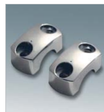
⑬ Handlebar Clamp Stylish chrome handlebar clamps, buffed and polished for a smoother, longer-lasting finish.