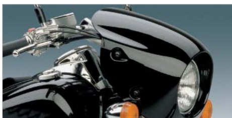
① Headlight Cowl Headlight cowl adds to the appearance of the headlight, available in body colours.