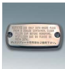
⑪ Front Brake Master Cylinder Cap A billet finished cap to add extra detail.