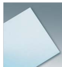
⑱ Protective Film This self-adhesive, clear film can be cut to fit any area of paintwork, to help prevent scratches.