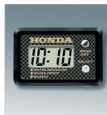
⑫ Mini Clock Useful carbon dial clock only 3.5 x 2.3 x 1cm in size, guaranteed to be fully waterproof.