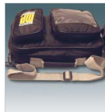
⑧ Magnetic Tank Bag 13ltr Useful magnetic tank bag providing 13 litre capacity. Stores an A4 size file, plus personal belongings. Complete with rain cover.