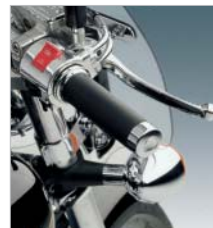
⑤ Chrome Lever Kit Deluxe chrome lever kit for the front brake and clutch.