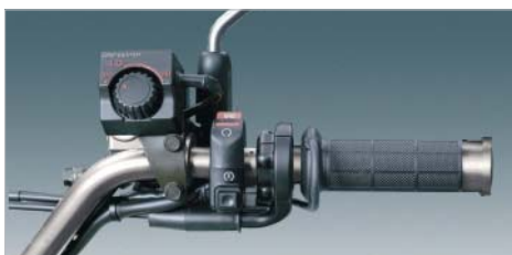
⑭ Grip Heater Kit ⑮ Sub Harness + ⑯ Sub Harness -

Flexible, adjustable grip heater to warm fingers on cold winter mornings. The grip heater incorporates a plate that heats the underside of the grip. Integrated circuit to protect the battery from drain. For connection you should purchase items 15 and 16.