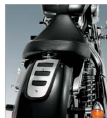
③ Single Seat This comfortable single seat comes with a stylish chrome and leather rear mudguard protector.