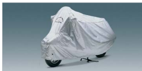
⑰ Body Cover Manufactured from water-resistant, breathable fabric that enables the motorcycle to dry. Offers good protection from UV rays. A rope is included to tighten the lower edges to avoid damage in bad weather. Also there are two holes in the front so that a lock may be used.

Flexible, adjustable grip heater to warm fingers on cold winter mornings. The grip heater incorporates a plate that heats the underside of the grip. Integrated circuit to protect the battery from drain. For connection you should purchase items 15 and 16.