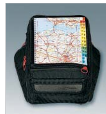
⑨ Magnetic Tank Bag 3ltr Ideal for city use, this easily accessible magnetic tank bag features a rain cover and provides 3 litre extra storage capacity for sunglasses, mobile etc. The top section has a large map pouch.