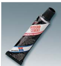
⑲ Honda Bond A A special, heat-resistant glue to be used when fitting heated grips.