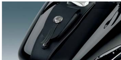
④ Leather Tank Belt Split leather belt with pocket. Decorated with Honda concho.