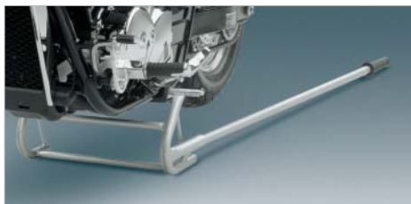
⑦ Maintenance Stand Simplifies rear-wheel alignment and chain adjustment. Lever handle can be taken away for easy access.