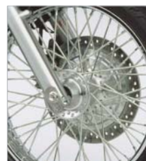
② Front Brake Calliper Cap Billet finish, front brake calliper cap for added style.