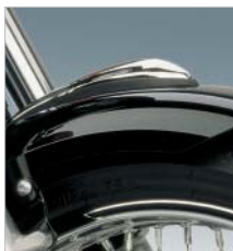
⑥ Front Mudguard Ornament Polished aluminium feature that adds authentic character.