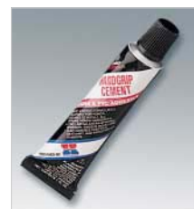
24) Honda Bond A A special, heat-resistant glue to be used when fitting heated grips.