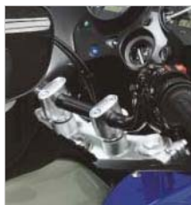
11) Handlebar Bridge Easy to fit aluminium bolt-on bridge, installed to carry a handlebar pocket bag.