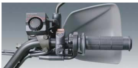
15) Grip Heater Kit 16) Sub Harness + 17) Sub Harness - Flexible, adjustable grip heater to warm fingers on cold winter mornings. The grip heater incorporates a plate that heats the underside of the grip. Integrated circuit to protect the battery from drain. For connection you should purchase items 15, 16 and 17.