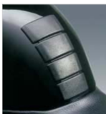
21) Tank Pad 2 A specially designed tank pad to protect your tank from scratches.