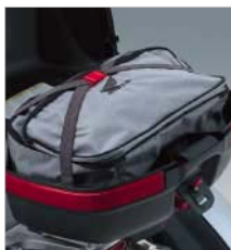
9) Deluxe Top Box Inner Bag Light Grey nylon bag with expandable capacity from 21-33 litres. Handy front pocket with Black embroidered Honda Wing logo, (takes A4 file), adjustable shoulder belt and carrying handle.