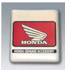
25) Emblem Honda Wing logo which can be used with a top box or pannier set.