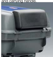
14) Top Box Pad A backrest pad on the top box gives greater pillion comfort. Only required for item 1