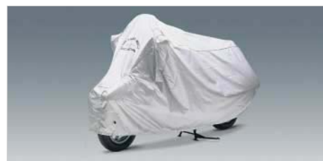
19) Body Cover Manufactured from water-resistant, breathable fabric that enables the motorcycle to dry. Offers good protection from UV rays. A rope is included to tighten the lower edges to avoid damage in bad weather. Also there are two holes in the front so that a lock may be used.