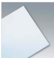
22) Protective Film This self-adhesive, clear film can be cut to fit any area of paintwork, to help prevent scratches.