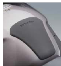
23) Tank Pad Rugged, padded tank protector, featuring 3D Honda logo.