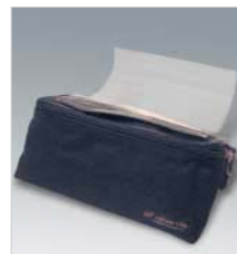
12) Steering Handlebar Pocket Bag Handy bag to sit on the handlebar bridge of the motorcycle, easily turned into a waist bag. Includes a transparent map holder. 230 x 100 x 50 mm.