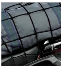
20) Cargo Net Useful net to secure luggage to rear carrier and/or pillion seat. Available in Black.