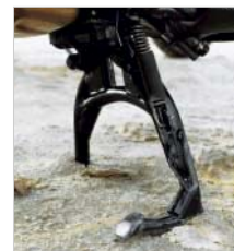
13) Main Stand Conventional centre stand, providing optimal stability on variable ground surfaces, while facilitating rear wheel maintenance. No main stand grip required.