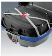
10) Top Box 45ltr Inner Bag Black nylon bag with expandable capacity from 21-33 litres. Handy front pocket with Honda Wing logo, (takes A4 file), adjustable shoulder belt and carrying handle.