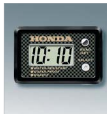
13 Mini Clock Useful carbon dial clock only 3.5 x 2.3 x 1 cm in size, guaranteed to be fully waterproof.