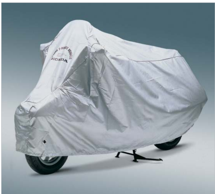
25 Body Cover Manufactured from water-resistant, breathable fabric that enables the motorcycle to dry. Offers good protection from UV rays. A rope is included to tighten the lower edges to avoid damage in bad weather. Also there are two holes in the front so that a lock maybe used.