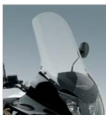
17 Tall Windshield 20cm higher, Polycarbonate screen improves wind protection and reduces riding fatigue. An additional stay, is concealed underneath the meters avoiding any unpleasant vibrations.