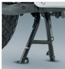
12 Centre Stand Conventional centre stand, providing optimal stability on variable ground surfaces.