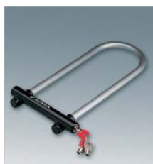
23 U-Lock 120/340 Designed to offer greater security. Complete with tamper-resistant barrel and key. Easily stored under seat.