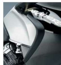
14 Side Visor Set 15 Upper Side Visor Set 16 Lower Side Visor Set Two upper and lower wind deflectors, offering protection from high winds and the elements.