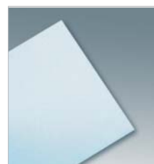
24 Protective Film This self-adhesive, clear film can be cut to fit any area of paintwork, to help prevent scratches.