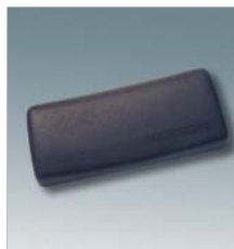
11 Top Box Pad A backrest pad on the top box gives greater pillion comfort.