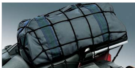
22 Cargo Net Useful net to secure luggage to rear carrier and/or pillion seat. Available in Black.