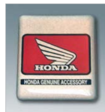
27 Emblem Honda Wing logo which can be used with a top box or pannier set.

These specification details do not apply to any particular product which is supplied or offered for sale. Manufacturers reserve the right to vary their specifications, including colours, with or without notice and at such times in such manner as they think fit. Major as well as minor changes may be involved. Every effort, however, is made to ensure the accuracy of the particulars contained in this brochure. This publication shall not constitute in any circumstances whatsoever an offer by the Company to any person. All sales are made by the Distributor or Dealer concerned subject to and with the benefit of the standard Conditions of Sale and Warranty given by the Distributor or Dealer, copies of which may be obtained from him on request. This publicity material applies to the UK only Trade Descriptions Act (1968). Whilst efforts are made to ensure specification accuracy, brochures are prepared and printed several months in advance of distribution and consequently cannot always immediately reflect either changes in specification or in some isolated cases the provision of a particular feature. Customers are always advised to discuss specification details with the supplying Dealer especially if your selection is dependent upon one of the features advertised. Subject to availability.