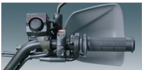
18 Grip Heater Kit 19 Sub Harness + 20 Sub Harness - Flexible, adjustable grip heater to warm fingers on cold winter mornings. The grip heater incorporates a plate that heats the underside of the grip. Integrated circuit to protect the battery from drain. For connection you should purchase items 19, 20 and 21. 21 Heated Grip Switch Bracket