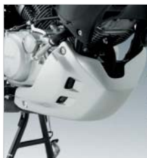
10 Under Cowl A belly pan will help protect your engine from scratches. Silver.