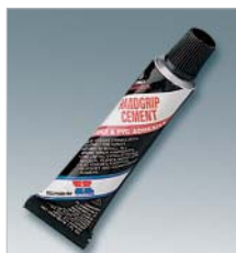
26 Honda Bond A A special, heat-resistant glue to be used when fitting heated grips.