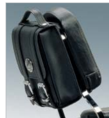
④ Backrest Bag 1.7ltr

Chrome-plated steel plates with decorative cut-outs emphasise the massive motorcycle.