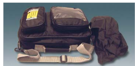
⑥ Magnetic Tank Bag 13ltr

Useful magnetic tank bag providing 13 litre capacity. Stores an A4 size file, plus personal belongings. Complete with rain cover.