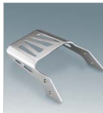
③ Rear Carrier

Chrome-plated steel plates featuring decorative cut-outs emphasising the massive motorcycle. Backrest pad included. Synthetic leather backrest matches machine seat and skin.