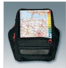
⑤ Magnetic Tank Bag 3ltr

A split leather 1.7 litre backrest bag decorated with Honda concho.