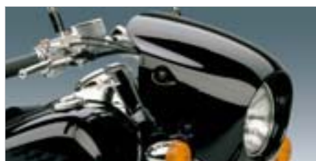
① Headlight Cowl Headlight cowl adds to the appearance of the headlight, available in body colours.