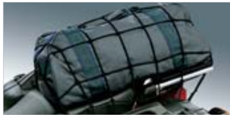
⑳ Cargo Net Useful net to secure luggage to rear carrier and/or pillion seat. Available in Black.

These specification details do not apply to any particular product which is supplied or offered for sale. Manufacturers reserve the right to vary their specifications, including colours, with or without notice and at such times in such manner as they think fit. Major as well as minor changes may be involved. Every effort, however, is made to ensure the accuracy of the particulars contained in this brochure. This publication shall not constitute in any circumstances whatsoever an offer by the Company to any person. All sales are made by the Distributor or Dealer concerned subject to and with the benefit of the standard Conditions of Sale and Warranty given by the Distributor or Dealer, copies of which may be obtained from him on request. This publicity material applies to the UK only Trade Descriptions Act (1968). Whilst efforts are made to ensure specification accuracy, brochures are prepared and printed several months in advance of distribution and consequently cannot always immediately reflect either changes in specification or in some isolated cases the provision of a particular feature. Customers are always advised to discuss specification details with the supplying Dealer especially if your selection is dependent upon one of the features advertised. Subject to availability.