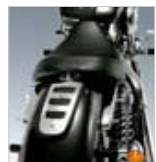
③ Single Seat This comfortable single seat comes with a stylish chrome and leather rear mudguard protector.