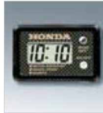
⑫ Mini Clock Useful carbon dial clock only 3.5 x 2.3 x 1cm in size, guaranteed to be fully waterproof.