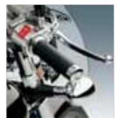
⑤ Chrome Lever Kit Deluxe chrome lever kit for the front brake and clutch.