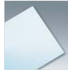
⑱ Protective Film This self-adhesive, clear film can be cut to fit any area of paintwork, to help prevent scratches.