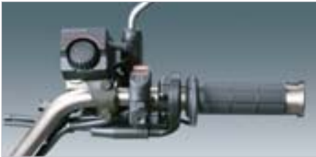
⑭ Grip Heater Kit ⑮ Sub Harness + ⑯ Sub Harness -

Flexible, adjustable grip heater to warm fingers on cold winter mornings. The grip heater incorporates a plate that heats the underside of the grip. Integrated circuit to protect the battery from drain. For connection you should purchase items 15 and 16.