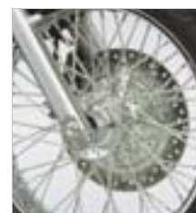
② Front Brake Calliper Cap Billet finish, front brake calliper cap for added style.