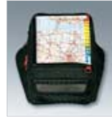
⑨ Magnetic Tank Bag 3ltr Ideal for city use, this easily accessible magnetic tank bag features a rain cover and provides 3 litre extra storage capacity for sunglasses, mobile etc. The top section has a large map pouch.