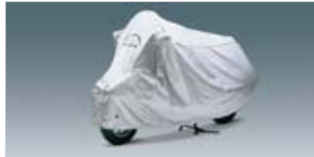
⑰ Body Cover Manufactured from water-resistant, breathable fabric that enables the motorcycle to dry. Offers good protection from UV rays. A rope is included to tighten the lower edges to avoid damage in bad weather. Also there are two holes in the front so that a lock may be used.

Flexible, adjustable grip heater to warm fingers on cold winter mornings. The grip heater incorporates a plate that heats the underside of the grip. Integrated circuit to protect the battery from drain. For connection you should purchase items 15 and 16.