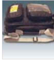
⑧ Magnetic Tank Bag 13ltr Useful magnetic tank bag providing 13 litre capacity. Stores an A4 size file, plus personal belongings. Complete with rain cover.