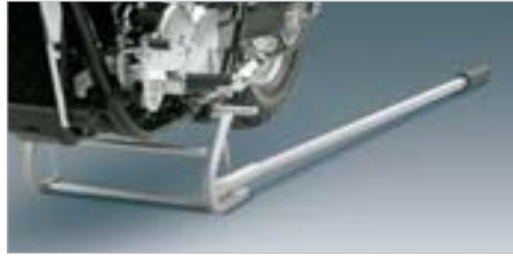
⑦ Maintenance Stand Simplifies rear-wheel alignment and chain adjustment. Lever handle can be taken away for easy access.