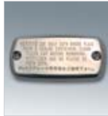
⑪ Front Brake Master Cylinder Cap A billet finished cap to add extra detail.