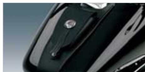
④ Leather Tank Belt Split leather belt with pocket. Decorated with Honda concho.