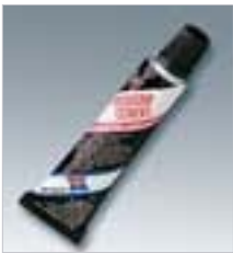
⑲ Honda Bond A A special, heat-resistant glue to be used when fitting heated grips.