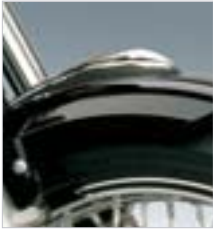
⑥ Front Mudguard Ornament Polished aluminium feature that adds authentic character.