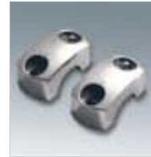
⑬ Handlebar Clamp Stylish chrome handlebar clamps, buffed and polished for a smoother, longer-lasting finish.