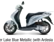
Winter Lake Blue Metallic (with Ardesia Grey)