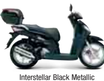
Interstellar Black Metallic