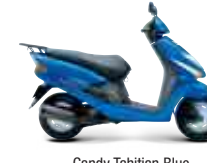
Candy Tahitian Blue