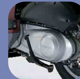
Strong, responsive performance from the liquid cooled 4-stroke fuel injected engine delivers all the power required to cut through busy city traffic.