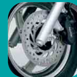
The Combined Braking System provides assured braking across front and rear wheels in a range of road conditions.