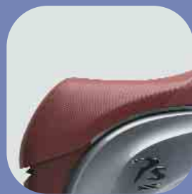
Seat shape and height are optimised for a relaxed riding position and superb riding comfort.