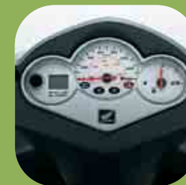
The large, beautifully sculpted instrument panel features a speedometer, fuel gauge, LCD odometer, trip and useful oil change meter.