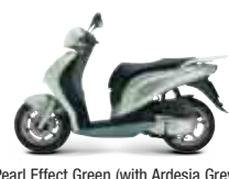
Pearl Effect Green (with Ardesia Grey)