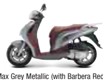
Max Grey Metallic (with Barbera Red)