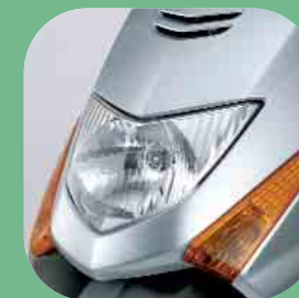
Large, integrated headlight and prominent indicators get attention whatever the weather.