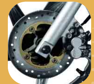
Lightweight dual-piston calliper front brake combines with rear drum for smooth, responsive braking control at the touch of a single lever.