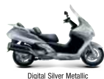
Digital Silver Metallic