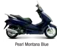
Pearl Montana Blue