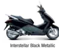
Interstellar Black Metallic