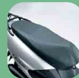
The low duo seat allows shorter riders and passengers to ride with ease and confidence.