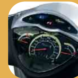
Modern and beautifully designed instrument panel provides an easy view of all operating parameters at a glance.