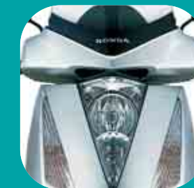
Sharp, minimal front cowl design aids wind resistance while the dual headlight illuminates the night ahead.