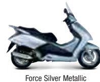
Force Silver Metallic