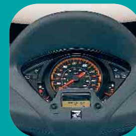
The fully integrated instrument panel features a clear view of all the riding information you need on the move.

High on style, low on size, the Pantheon 125 draws on the energy of city life with its sleek, sculpted approach. With the ample acceleration from the fuel injected 125cm 3 engine and the dynamic and assured power of Honda's Combined Braking System to stop you on demand, the Pantheon 125's sprightly performance brings the city alive. Sat in the deeply stepped seat with the clear, accessible dashboard laid out in front on you, it soon becomes equally clear that Pantheon is built around you. With large, accessible storage and strong wind coverage, the Pantheon is at home on the way to work as playing away at the weekend.