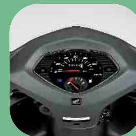
Stylish recessed instrument panel offers easy view of all the information you need during your ride.

Its curvy, sculpted looks and agile frame are only one aspect of the celebrated Lead 100. With its low, duo seat allowing shorter riders easy reach to the ground and the proportioned fairing offering great wind protection, you are left free to enjoy the exhilarating performance from the compact air cooled 100cm 3 engine. With large underseat storage hidden from view underneath the compact body, the Lead 100 is more than ready to help you travel. And with ultra comfortable rider and passenger seating giving you hours of hassle free riding, there isn't any part of town you can't explore.