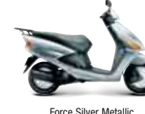
Force Silver Metallic