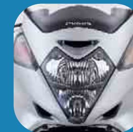
The front cowl incorporates a distinctive 'piggyback'-style dual multi-reflector headlight, which offers ample illumination to safely drive into the night.