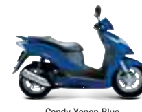
Candy Xenon Blue