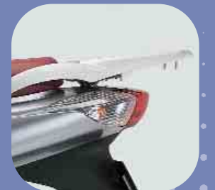
The PS125i's sculped tail is topped by a sturdy cast resin carrying rack with comfortable passenger hand grips.