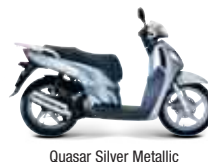
Quasar Silver Metallic