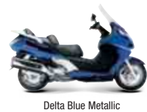
Delta Blue Metallic