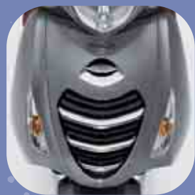
The attractive louvres of its forward-mounted radiator and large clear-lens indicators, give the PS125i's front façade a sleek look of timeless charm.