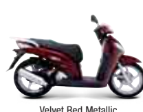
Velvet Red Metallic