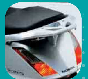
The beautifully crafted, fully integrated tail light declares your intentions to others, while the rear handle grip provides superior comfort for the passenger.