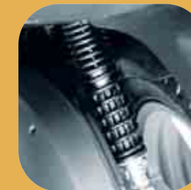
Supple, long-travel dual rear dampers really soak up the bumps for a comfortable ride and confident control.