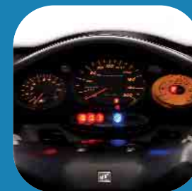
The beautifully designed instrument panel features a full complement of dials and indicators to keep track of all the required parameters.

Combining the soul of a tourer with the body of a sleek, agile city commuter, the Silver Wing ABS provides a luxurious alternative for weekday commuting and a refreshing option for a weekend getaway. Boasting a responsive DOHC parallel twin 600cm 3 engine with Honda's famed PGM-FI fuel injection system, lightweight design based on a centre backbone steel tube frame, and the assured stopping power of Honda's Antilock Braking System, the Silver Wing ABS gives you the confidence and poise to traverse the city and the power to ride across country in style. Get on, open the throttle and you can't but be in awe of this impressive beauty.