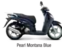
Pearl Montana Blue