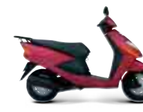
Candy Blazing Red