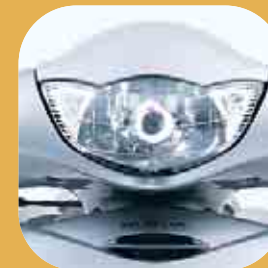
Large, bright multi-reflector headlight provides a broad range of confidence-inspiring illumination on even the darkest nights.

From the fuel injected 125cm 3 engine, to the emphatic styling, with just one look at the SH125i you know you're near something special. Fusing classic lines with cutting-edge technology like the Combined Braking System, the SH125i moves fast and handles like a dream through the tightest of spaces - giving you the confidence you need to meet every appointment you make. Featuring supple suspension, coupled with high comfort seating, the SH125i is dedicated to comfort and convenience. And with the cavernous underseat storage and glovebox, you can transport everything from shopping to briefcases effortlessly across town.