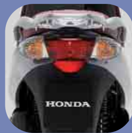
A large, integrated tail-light and clear-lens indicator assembly complement the stylish look of the PS125i's sculpted tail.