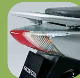
In keeping with the Dylan 125's pointed look, the rear end features a minimal and efficient passenger hand grip and integrated tail-light.