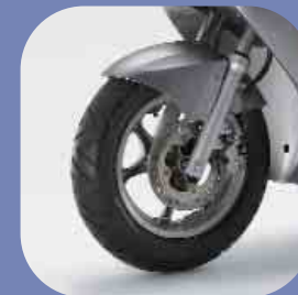
The Combined Brake System gives unrivalled operating ease and effortless control for assured braking confidence.

With a timeless look of modern style, the PS125i will appeal to those looking for something out of the ordinary. From its elegantly contoured full-bodied form to its easy step-through seating, wide floorboard and supple seat, the new PS125i offers both the look and feel of solid, reassuring quality infused with fresh and distinctive designed-in originality. Powered by a strong and highly reliable 4-stroke engine that features the latest fully integrated computerised fuel injection system, the PS125i really stands out with its low fuel consumption, and thanks to Honda's advanced HECS3 oxygen-sensing catalyser, it has lowest exhaust emissions in its class. Add in the smoothly responsive Combined Brake system, convenient under-seat storage and easy-riding comfort, and you'll soon realise the PS125i is just right for every occasion.