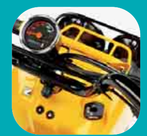
The simple instrument panel is in keeping with the Zoomer's minimal design.

Standing out is okay for some people but what if you want to lead the pack? With the Zoomer's carefree styling you prove a point every time you ride. Stripped down to reveal little more than its powerful fuel injected engine and industrial frame, the Zoomer is built for fun, whether in the city or cutting across sun kissed beaches. Adaptability is the key to the Zoomer. With ample open storage space, you can tie whatever you want to the frame. And if security is an issue then you can cover it with extra panels. If you want your life to break from the norm, the Zoomer will be able to take you there.