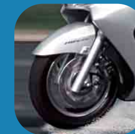
With Honda's unique Combined Braking System and ABS, the Silver Wing provides responsive and assured stopping power whatever the weather.