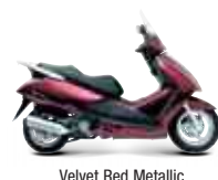
Velvet Red Metallic