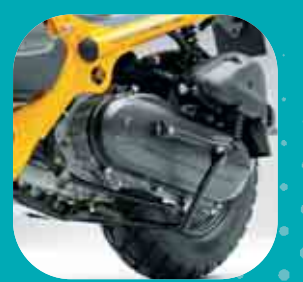
The fuel injected, high performance OHC engine delivers great performance and sharp acceleration.