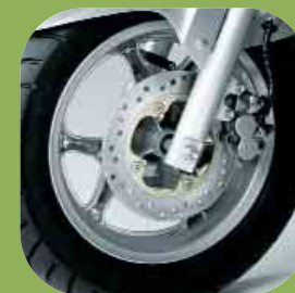
The sharp, efficient front disc brake and Combined Braking System offers controlled and stable braking under pressure.

Tired of being sat behind grey, slow moving traffic? Want to live fast and look good on the road? The innovative Dylan 125 may well have all the answers. And more. With its compact, minimal styling, carefree handling and punchy, liquid cooled 125cm 3 engine, the road will open up before your eyes. Blink and you'll miss it. Smooth, contoured seating for both rider and passenger makes hours in the saddle disappear instantly while the Dylan 125 packs enough storage to carry all your essentials wherever you're heading. And with a sharp look that defines your style, the Dylan 125 is the contemporary alternative to the city scooter.