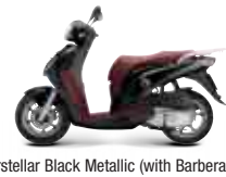
Interstellar Black Metallic (with Barbera Red)