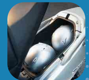
Vast underseat compartments provide ample storage for two people's belongings with room to spare.