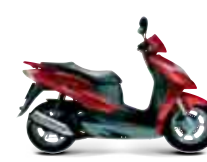
Candy Calcutta Red