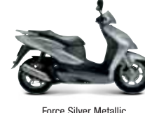
Force Silver Metallic