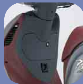
A useful locking glove compartment further enhances the PS125i's carrying convenience and security.

The new PS125i is sure to grab attention on the streets with attractive colours that accentuate its sporty urban design and friendly light-hearted disposition. And practical features are sure to appeal to daily commuters and the young at heart. There's a handy carrying space hidden under the locking tilt-up seat suitable for a full-face helmet - with room to spare. Up front a recessed locking compartment provides handy storage for gloves and other articles, while a spring-loaded hook will ensure your bags stay in place on the wide floor. And when more storage is needed, the rear carrier will take a specially designed 35 litre top box suitable for another full-face helmet.