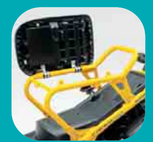
The Zoomer's 'open' underseat area leaves room to fix bags or stow luggage. With the seat lifting up to reveal additional access.