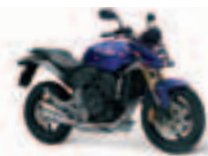
Candy Xenon Blue