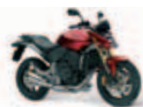
Pearl Siena Red

Honda machines sold in your area are those most suited to local conditions. Specifications, appearance and availability may differ depending on markets, and are subject to change without notice. For details, please consult your nearest Honda dealer.