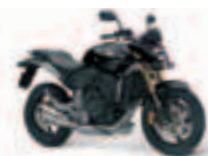
Pearl Night Star Black