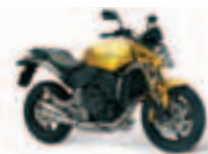
Pearl Amber Yellow